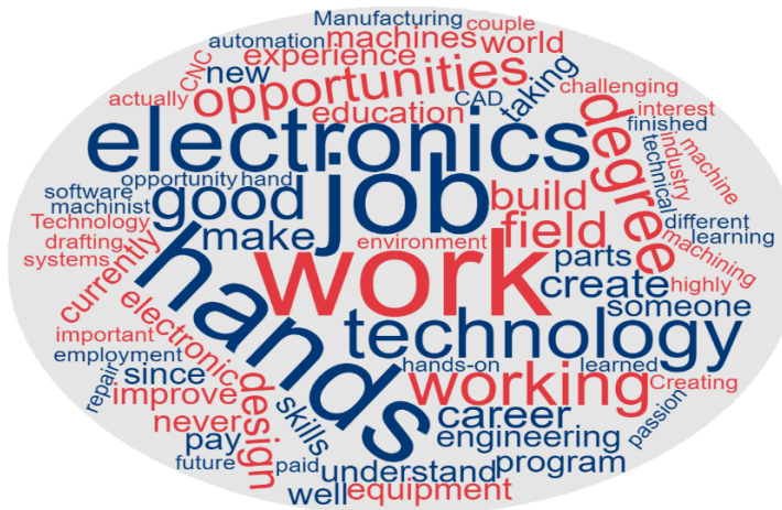
Figure 1. Word cloud of frequently used terms in students' descriptions of motivations for joining Engineering Technology programs

Figure 1 presents the terms most often used in these open-text explanations in the form of a word cloud, where the larger words are those that appear most often in the explanations. Favored features, such as hands-on work, jobs, technology, and working, all loom large.