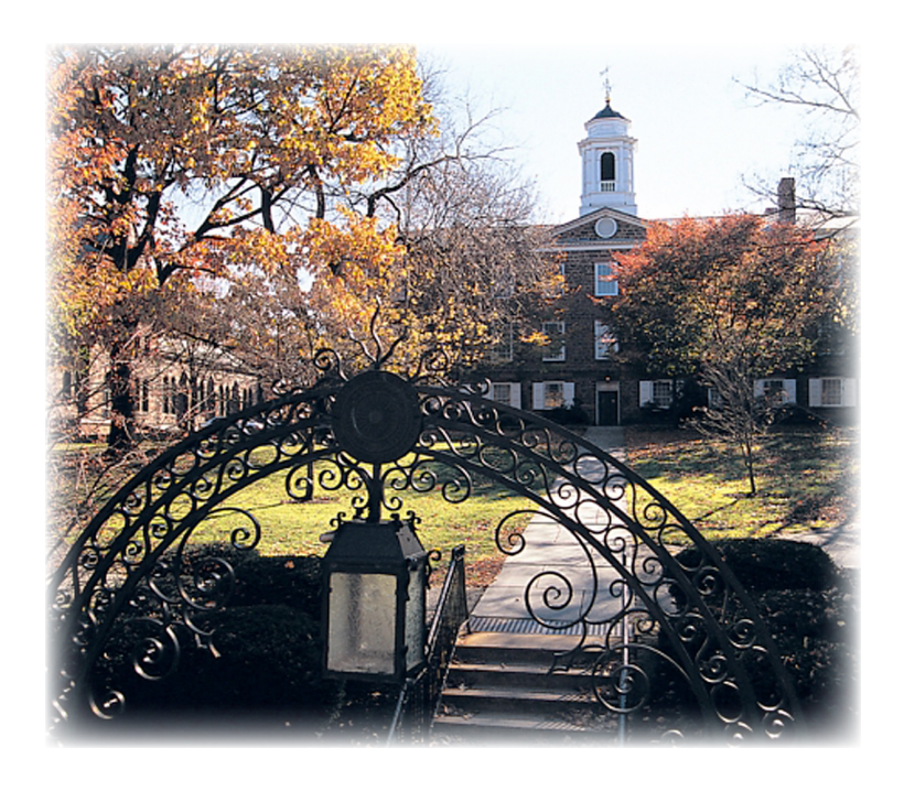
Nineteenth Convocation May 14, 2022

School of Management and Labor Relations